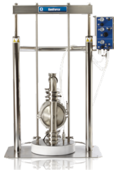
SaniForce 3150 Drum Unloader

All written and visual data contained in this document are based on the latest product information available at the time of publication. Graco reserves the right to make changes at any time without notice.