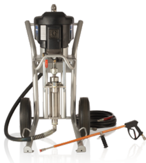
Hydra-Clean® Pressure Washers

Our industrial equipment offers a complete line of priming piston and air-operated double diaphragm pumps for low to high viscosity fluids for a wide range of applications.